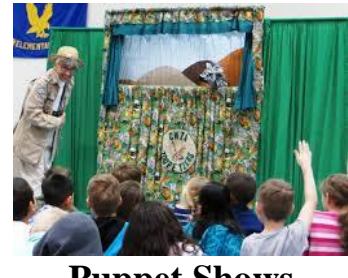
Puppet Shows Zoopeteer Programs

Description of Zoopeteer Programs: Do you want to have your students totally entertained and learn key science concepts about animals that are grounded in the Colorado Academic Standards and grade level expectations? Then the Zoopeteer Programs are for your students!