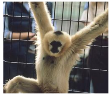
Amazing Mammals Tour Target Grades: Third Grade & Up

Description: This tour emphasizes mammalian characteristics, adaptations, basic needs, and habitats around the world. Students learn about similarities and differences between mammals ~ what adaptations make a mammal arboreal, terrestrial, or aquatic? What are the structural differences between carnivores, herbivores, and omnivores? What behavioral differences do we find between diurnal and nocturnal mammals? These questions and more will guide our exploration of mammals at Cheyenne Mt. Zoo.