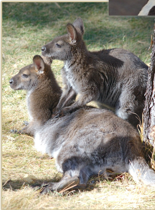
Page 1 picture of Ohe