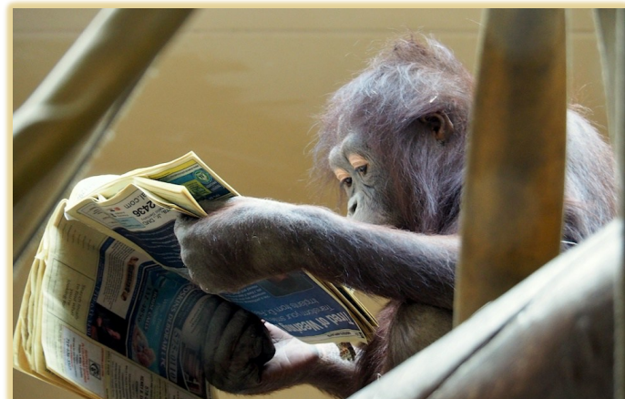
Ember, looking for enrichment