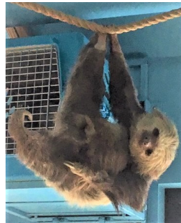
Thanks for “hanging in there”!