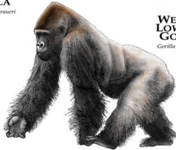
WESTERN LOWLAND GORILLA