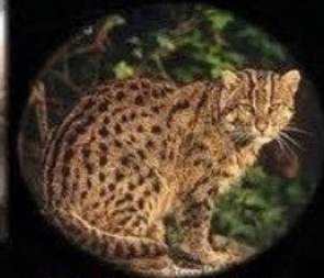
Fishing Cat (EN) pop. <10,000