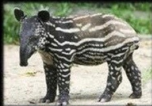
Malayan Tapir (EN) pop. 1,500-2,000