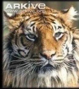
Sumatran Tiger (EN) pop. < 500