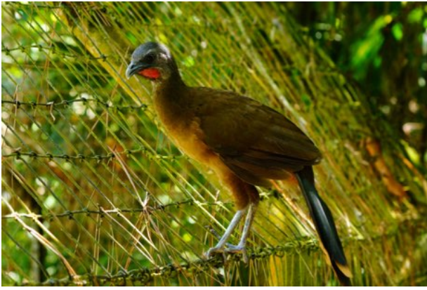
One of the unconfined denizens of the Belize Zoo. I do not know what type of bird this is.

Belize Zoo as donations from other zoological institutions.