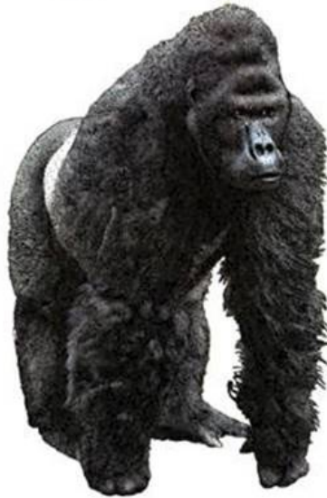
EASTERN LOWLAND GORILLA