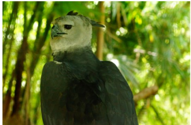
Harpy eagle. Rivals our Bald eagles in size.

Shortly after the backyard "zoo" began, it was quickly realized that its Belizean visitors were unfamiliar with the different species of wildlife which shared their country. This very aspect fomented the commitment to develop the little zoo into a dynamic wildlife education center.