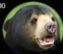
Sun Bear (VU) pop. ↓ 30% in last 10 years