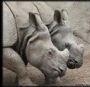
Sumatran Rhino (CR) pop. 170-230