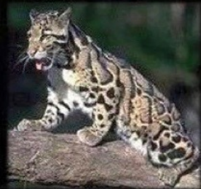
Clouded Leopard (VU) pop. < 1,500-3,200