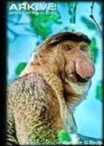
Proboscis Monkey (EN) pop. < 6,000