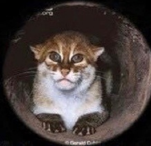
Flat-Headed Cat (EN) pop. < 2,500