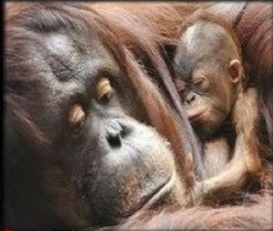
Orangutan Sumatran (CR) pop. 7,300 Bornean (EN) pop. 45-69,000 ↓ ~1,000 / yr