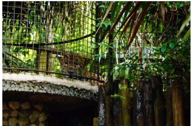
Jaguars are big! Note the 1950's style enclosure

The Belize Zoo was started in 1983, as a last ditch effort to provide a home for a collection of wild