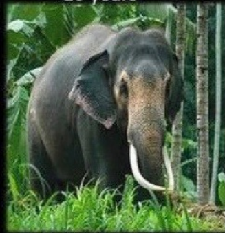
Asian Elephant (EN) pop. < 53,000