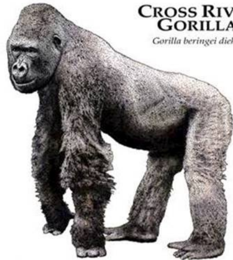
CROSS RIVER GORILLA