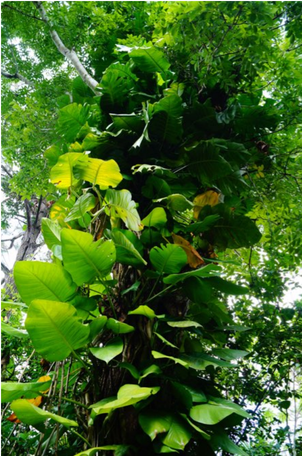
In this lush environment, philodendrons reach for the forest canopy.

Belize Zoo as donations from other zoological institutions.