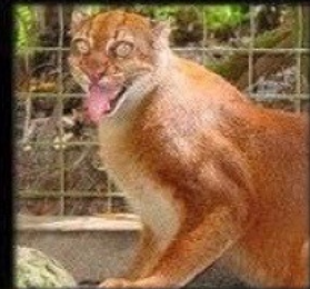
Bay Cat (EN) pop. < 2,500 <25 ever recorded