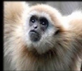
Lar Gibbon (EN) pop. 15-20,000