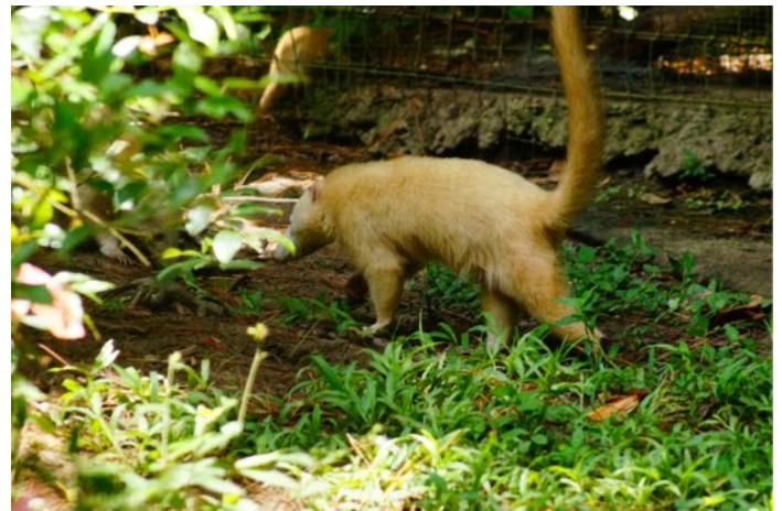
An albino coati mundi.

A visit to the zoo is the best way to get an introduction to the animals of Belize, and to understand why it is important to protect the habitats that sustain them. We hope this website will be the next best thing to visiting us in person.