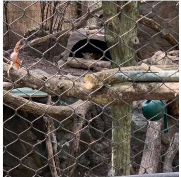
Clouded Leopard. Look closely.