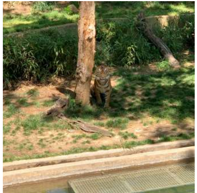
Sumatran Tiger (burning bright)