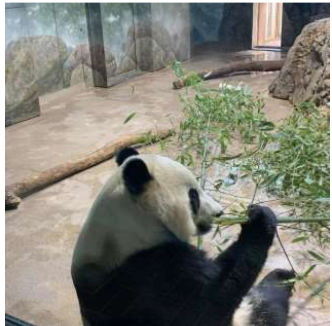
Bei Bei snacking

(Editor's note: Several years ago the CMZoo conducted a research project about signage and how much time people spent actually reading them – just a few seconds. As a result our exhibit signage numbers and holds less, but perhaps the most important information. Also some signage is really big - like the Palm Oil info and our conservation projects, for instance.)