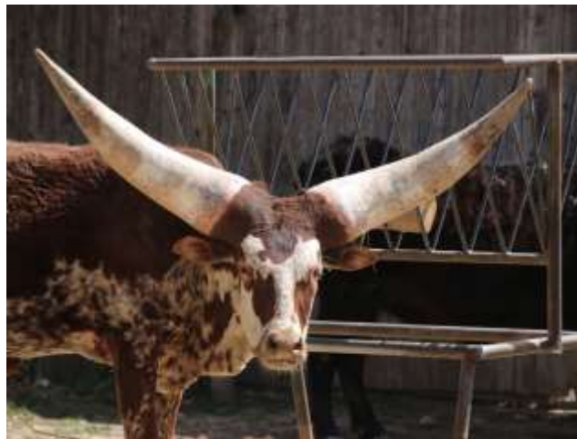
Osprey bringing fish to the nest and Watusi Cow