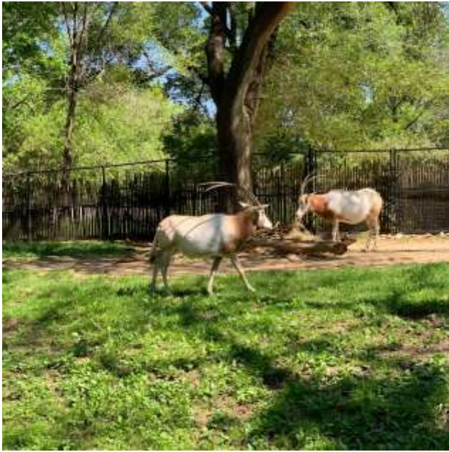
Scimitar Horned Oryx