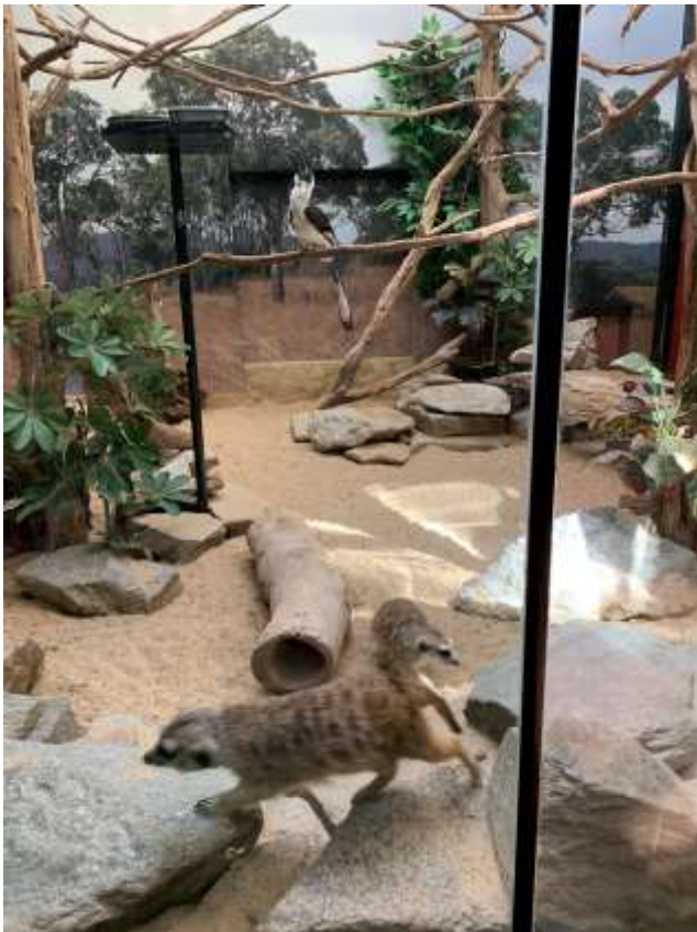
Mixed Exhibit of Hornbill and Meerkats