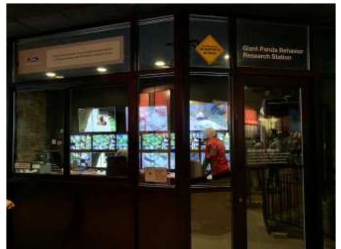
Panda Observation Station