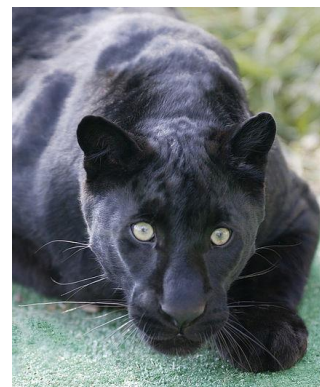
Eddy, black leopard raised as an orphan and featured on Animal Planet.

A bus (47 passenger) and a catered box lunch have been arranged. The bus will depart from the zoo parking lot at 8 am and return at 5 pm. The registration forms will be available at the August and September TE & IE meetings and were sent by email. The cost will be approximately $65 plus a donation for the Sanctuary and a tip for the driver. So select your options and turn them and your payment in at the September IE and TE meetings. Make checks payable to CMZ. Deadline for payments is September 14. For questions, please contact Julie Hall - 660-1944 or Ann Anderson - 488-0026.