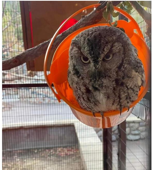
Hootenanny the Eastern Screech Owl by Alia Cooper