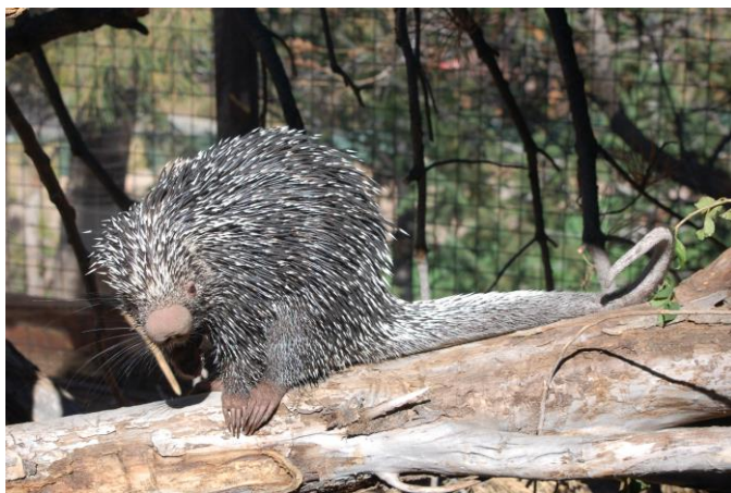
Mocha the Prehensile-Tailed Porcupine

We believe by sharing our passion for wildlife and wild places, our enthusiasm will be contagious.