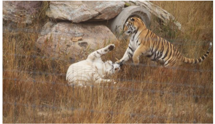
Above and below: tigers and wolves at the Wild Animal Sanctuary