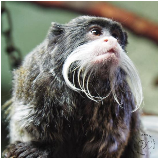
Female Emperor Tamarin by D. Compton