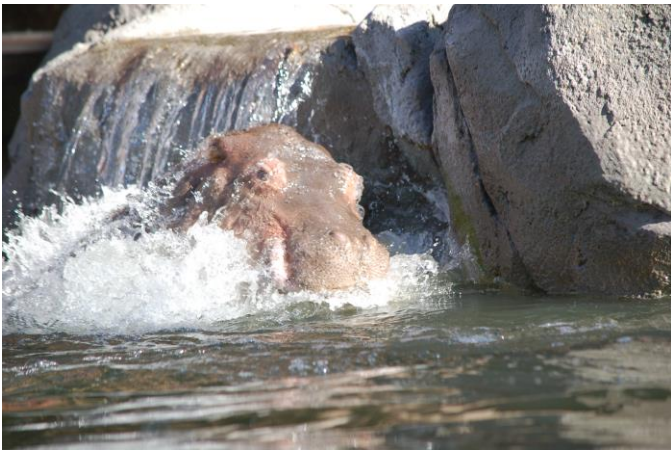
Omo Porpoising Under the Waterfall by Susan Hoxie