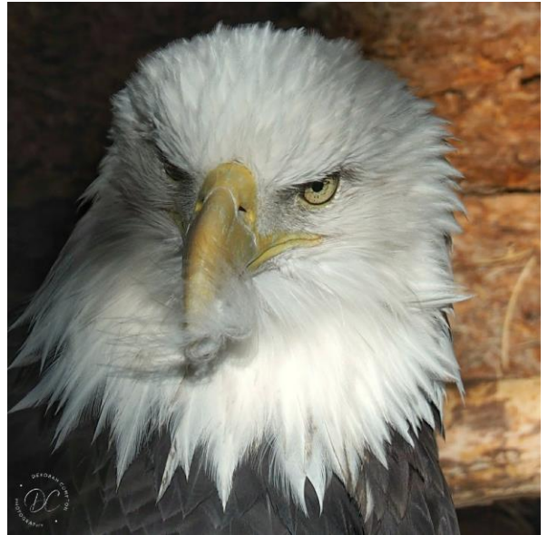
Ouray the Bald Eagle by D. Compton