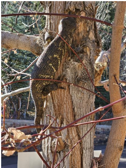
Wasabi the Prehensile Tailed Skink by Jeanie Baratano