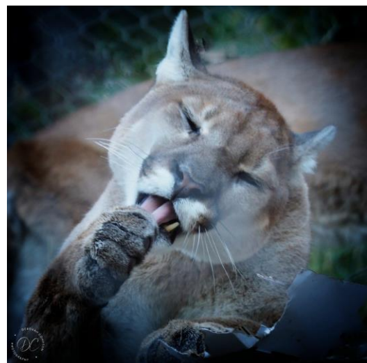
Mountain Lion by D. Compton