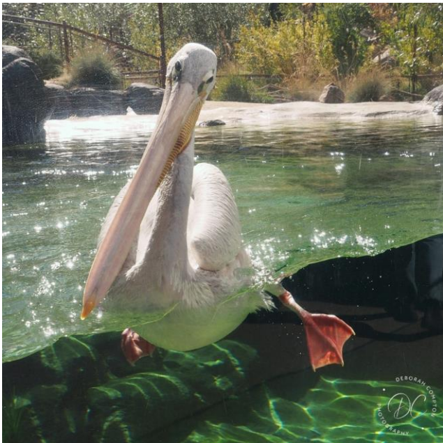
Plato the Pink-Backed Pelican by D. Compton