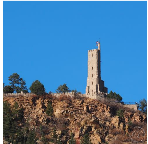
Will Rogers Shrine of the Sun