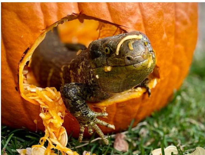
Prehensile-tailed skink smiling and happy

Every Kid. Every Time. Goosebumps! Every kid, of any age, will have an experience for a lifetime with every visit.