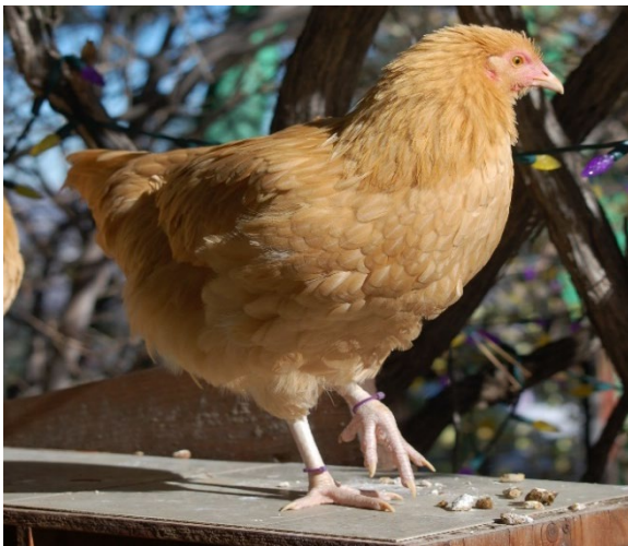
New Buff Orpington chicken, Courtesy of Susan Hoxie