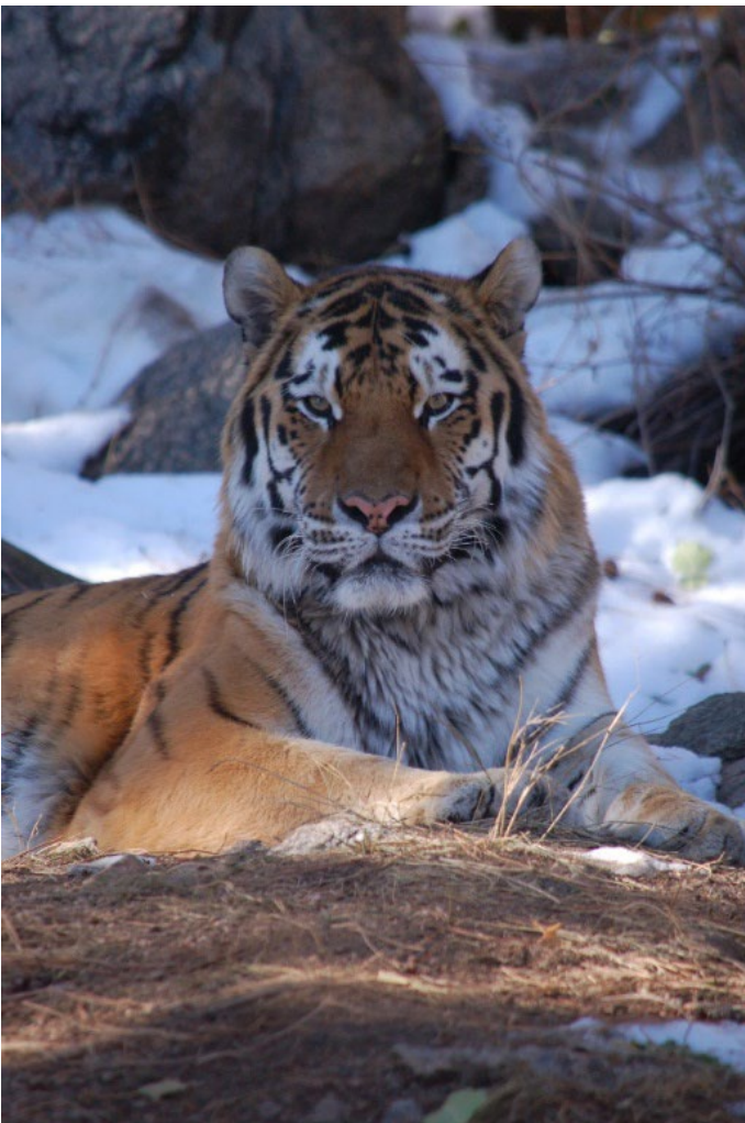
Chewy having some quiet time