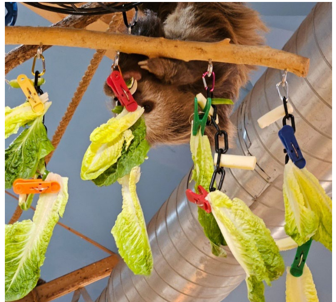
Bean (2 toed sloth) enrichment fun