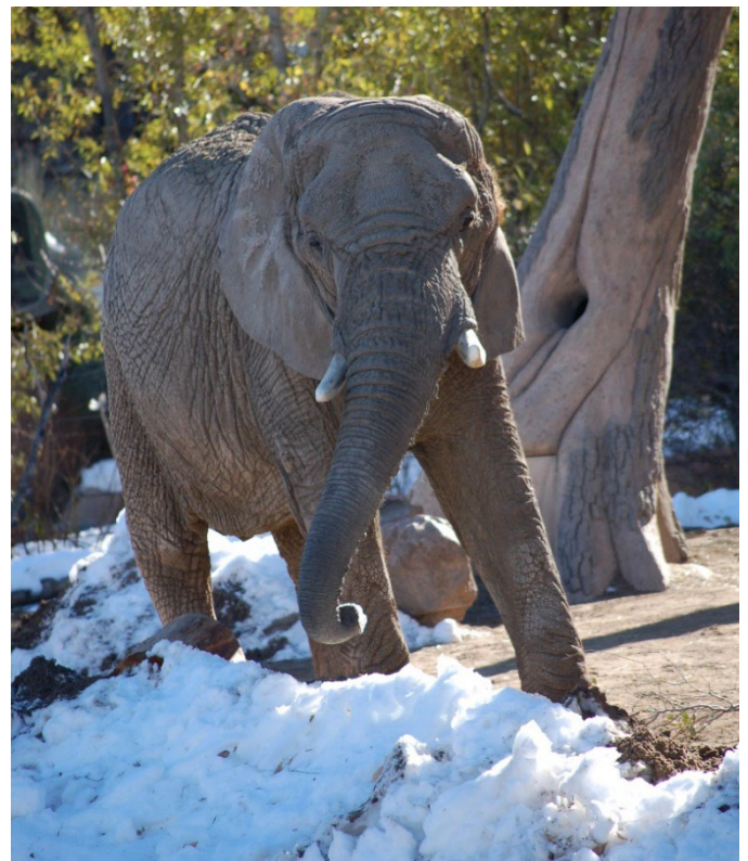
Lucky eating snow