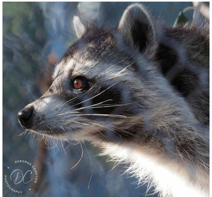
One of the raccoon brothers