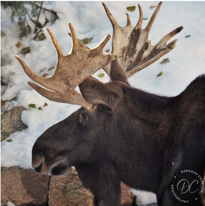
Atka with his impressive antlers