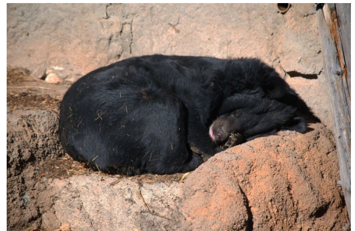
Beezler, catching some ZZZZs in the warm sun