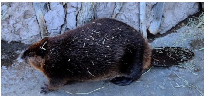
Acorn – a North American beaver out for a walkabout