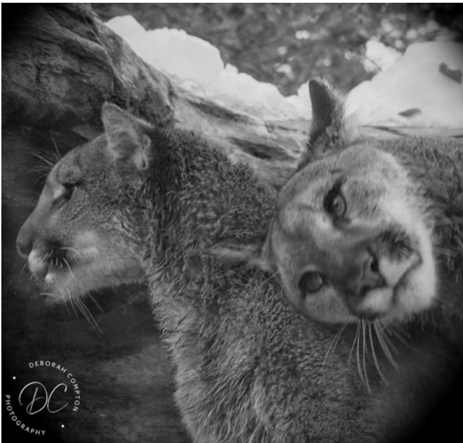
Loving each other – mountain lions