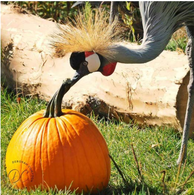
Inzi – East African crowned crane with pumpkin enrichment