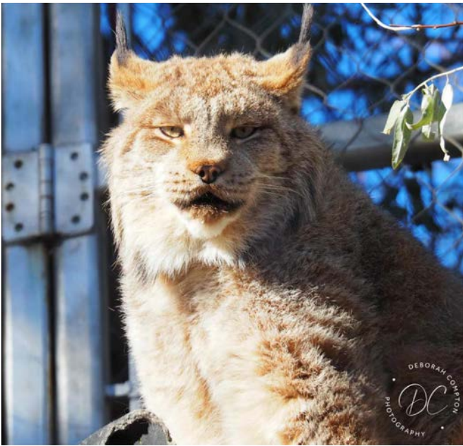
Kajika – one of the elusive Canadian lynx