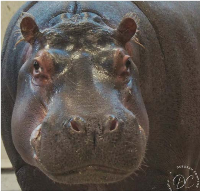
Everyone knows Omo —the favorite of most children