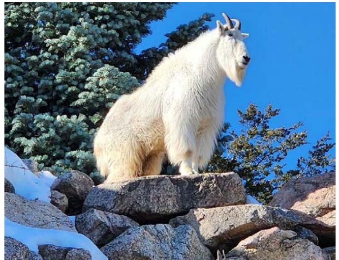
Rocky Mountain goat