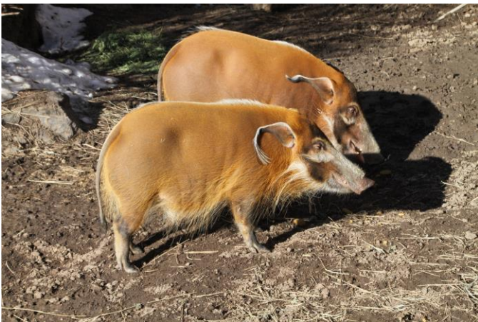
Rey and Finn, red river hog "sister wives"