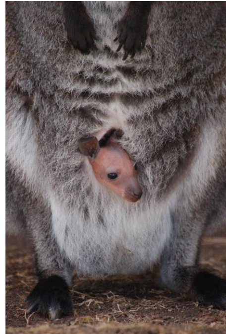
Gidgee's Joey