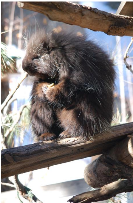
Roger the Porcupine