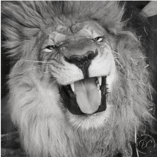
Aslan the African Lion