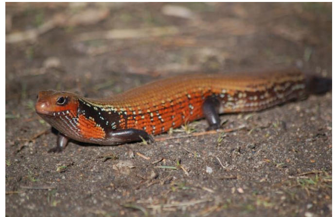
Togo the Fire Skink