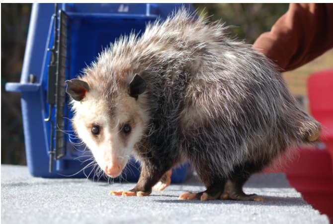
Hubble the Virginia Opossum