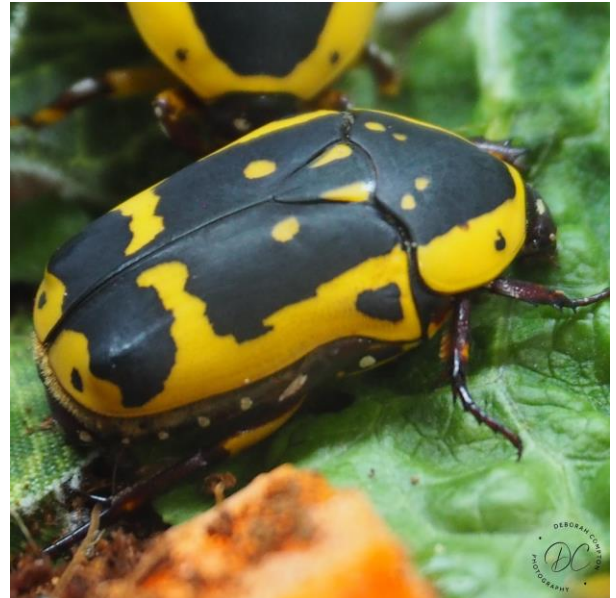
An African Fruit Chafer Beetle