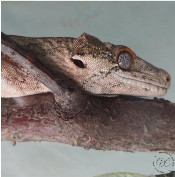
Gargoyle Gecko