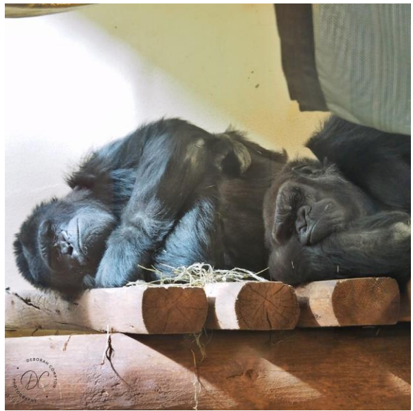
Western lowland gorillas Asha and Roxie relaxing together