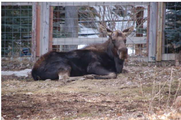
Atka post-antler shed

We Believe Statement: We believe long term conservation only comes with education and behavior change, but focused breeding programs and the humane care of wild animals are vital to preventing a species from becoming extinct while bridging that gap.