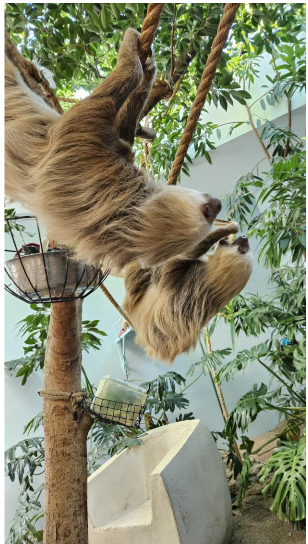
Ayson and Boscoe the Two-Toed Sloths Just Hanging Out