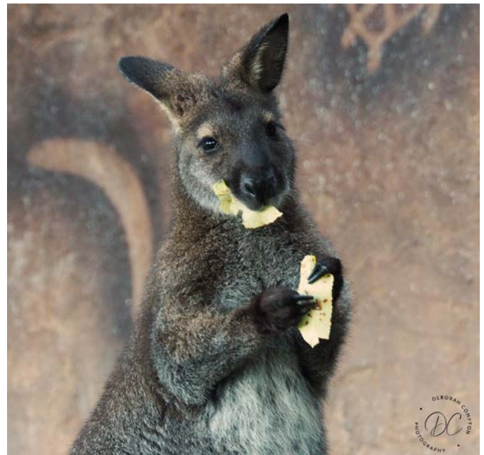
Who needs potato chips when you have autumn leaves to munch on? by Deborah Compton