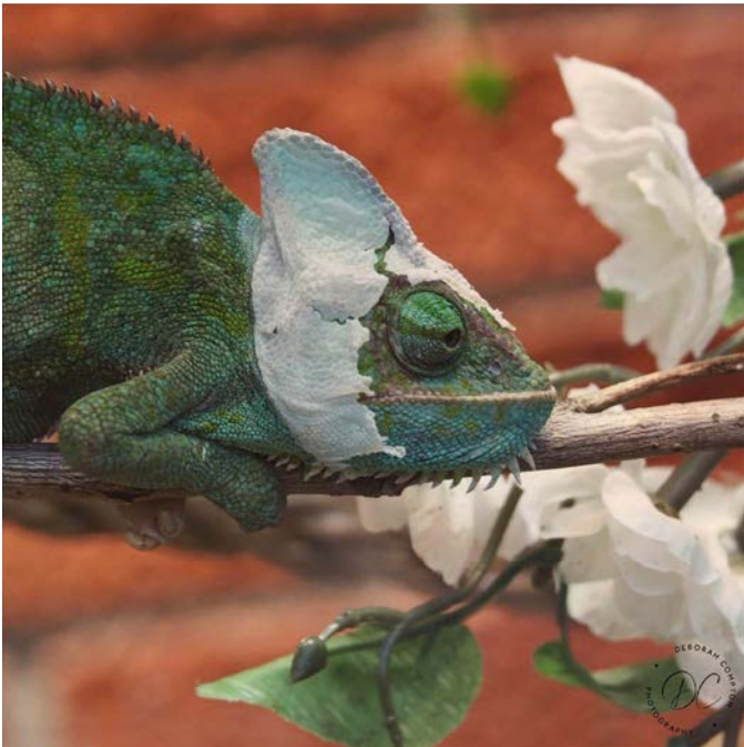
Veiled Chameleon Girl George shedding