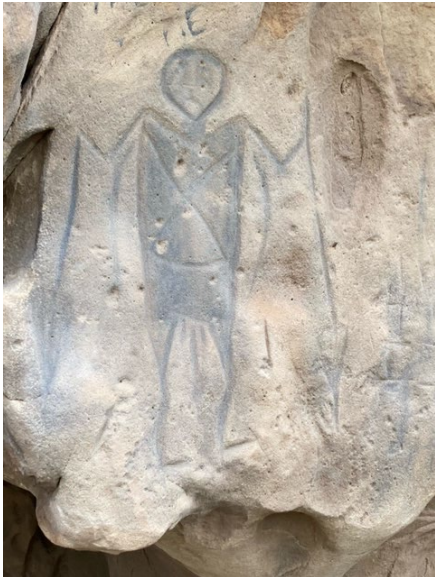
Woman giving birth