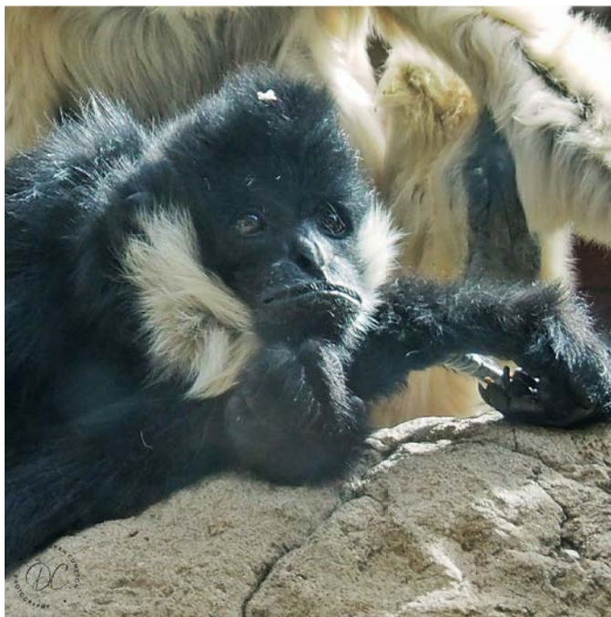
White-cheeked gibbon Tahn-Linh celebrating his 35th birthday on October 20

We believe we can make the world a better place, and the work we do and the way we treat other people matters.