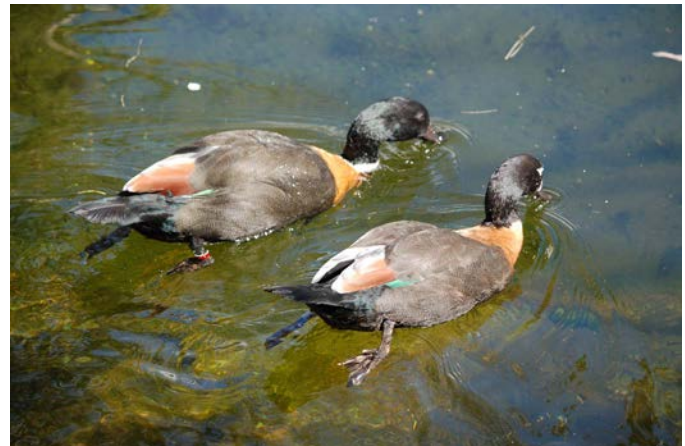
Shelducks (in Australia Walkabout) Conch (left) and Scallop (right with the white “eyeliner”) — females have white around their eyes, males don’t