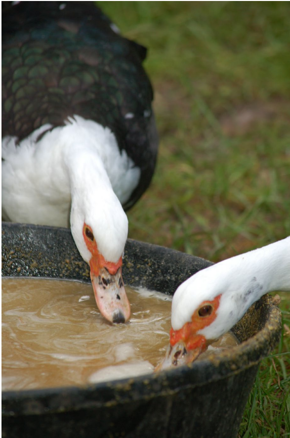
Muscovy ducks Francisca and Athena share space with Mochi the mountain tapir