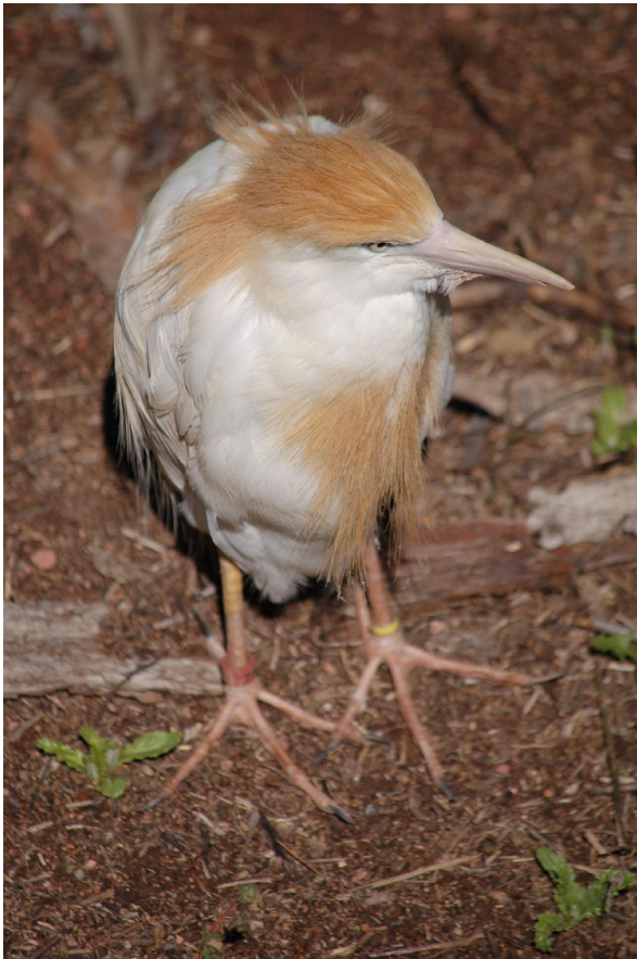
Unknown cattle egret (the colored feathers indicate he/she is in breeding mode), by Susan Hoxie