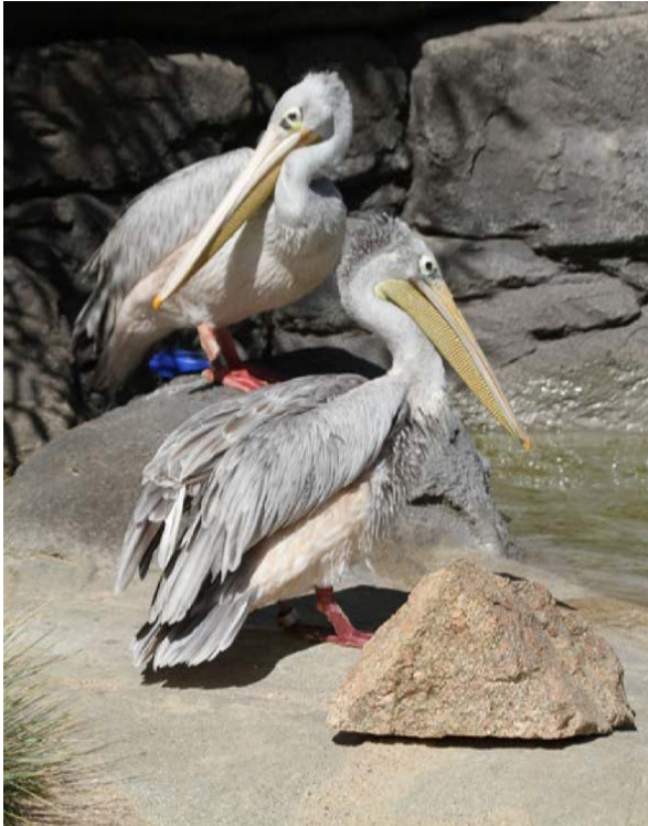
Pink-backed pelicans Plato (back) and Pandora (front) having a quiet (for them) moment