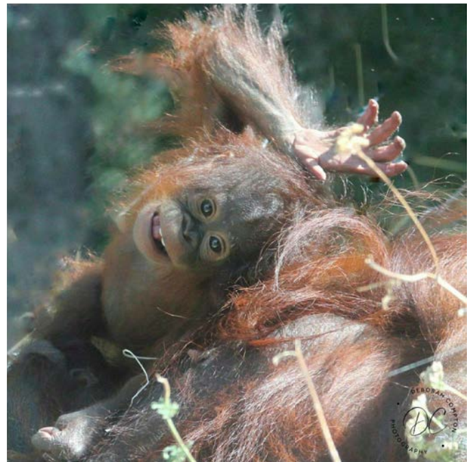
Flashback to Ember as a baby (she turned 9 October 29), by Deborah Compton