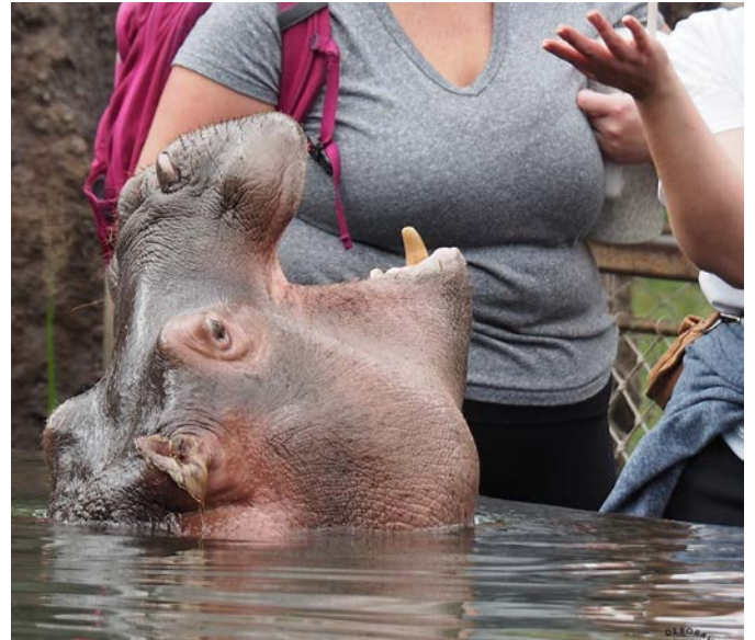
Omo participating in enrichment with zoo guests during behind-the-scenes tour