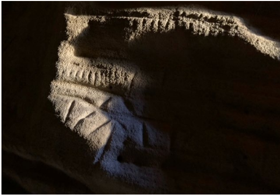
Light falling on the petroglyphs at sunrise