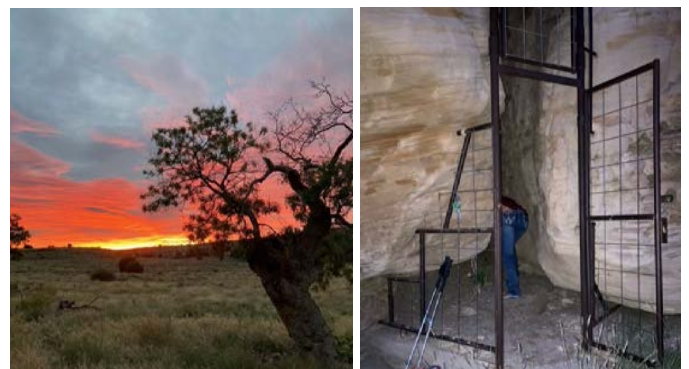
Sunrise at Crack Cave and the entrance to the cave

Two docents and friends spent the night in Springfield, CO, to witness the Equinox solar alignment that occurs at sunrise in Crack Cave. The sun's rays fall precisely on ancient markings on the cave wall only twice a year on Equinox morning for about 12–15 minutes. The group dined Friday evening then went in search of tarantulas but none were to be found. The group arrived at Picture Canyon Saturday at 5:30 a.m. (after a short detour to someone's compound thanks to Apple Maps). The canyon sunrise was stunning and the light on the glyphs was magical. Following the solar alignment, the group hiked to two more sites to see incredible petroglyphs. Leneha, from Canyon Journeys, was very knowledgeable about the glyphs and the ancient people who traversed the canyon. It was a wonderful trip except for the lack of tarantula encounters. We seemed to be the only ones who didn't see them!