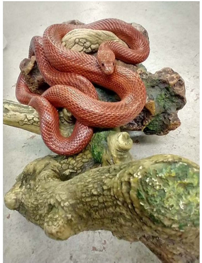
Carrot the Corn Snake, courtesy of Leah Capezio